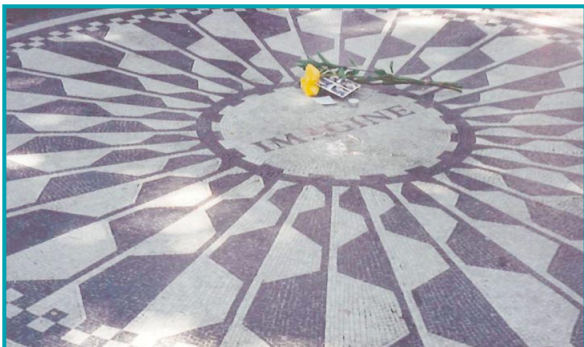
Imagine yourself in New York City's Central Park! Join us for the May Baseball and Broadway trip or our annual trip on NEOEA Day. (back cover)