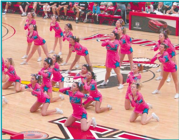
Spectators at the Game of Hope were fired up by the Dream Team All-Stars almost as much as they were by the play of Team Pegg. (page 4)